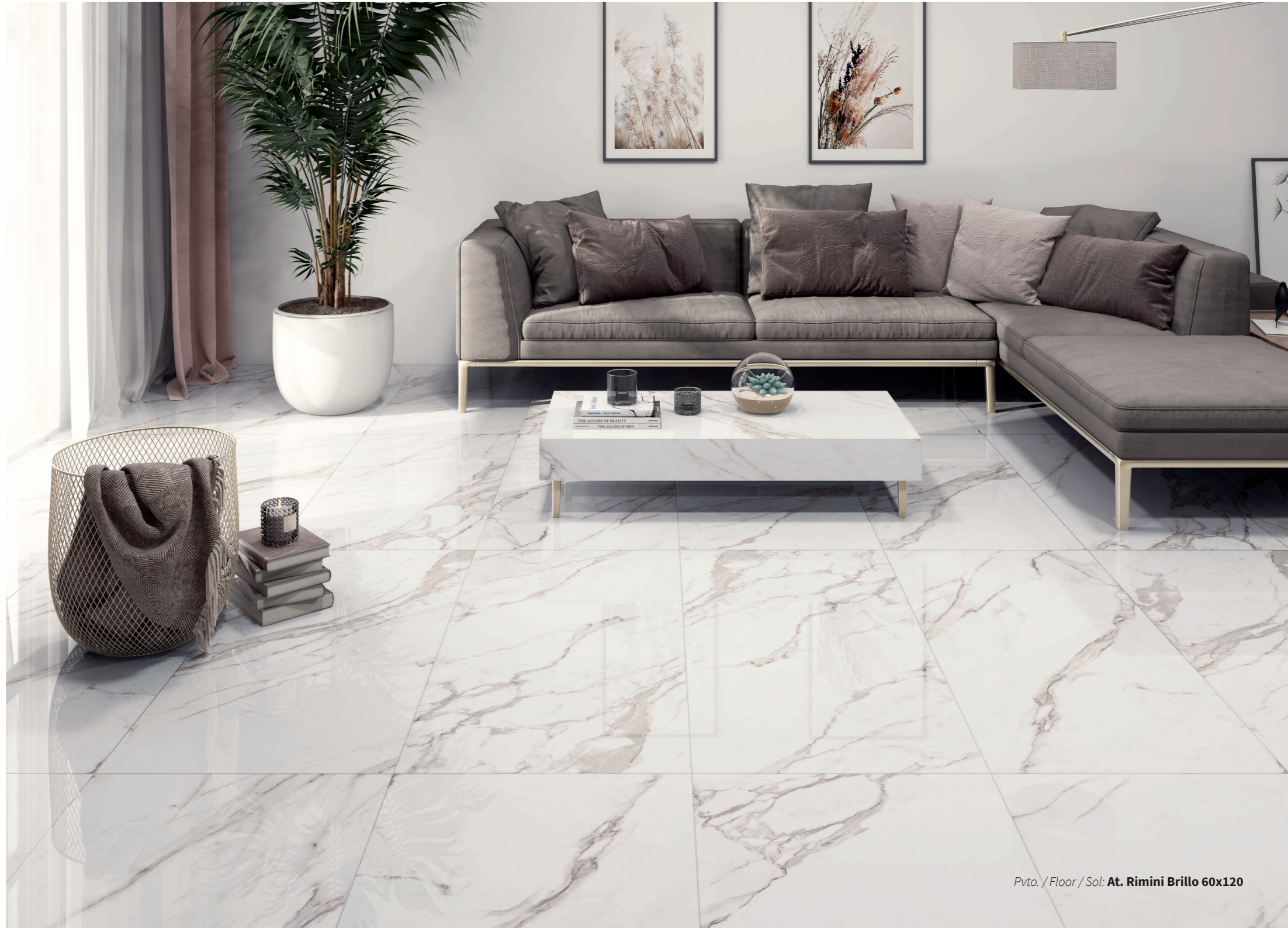
Pvto. / Floor / Sol: At. Rimini Brillo 60x120